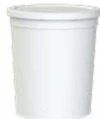
Mod.: 21126 32 oz. - (1 L) 4.57" (W) X 5.22" (H)