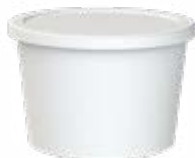
Mod.: 25026 16 oz. - (500 ml) 4.57" (W) X 3.03" (H)