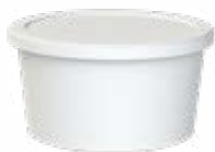
Mod.: 23526 12 oz. - (350 ml) 4.57" (W) X 2.40" (H)