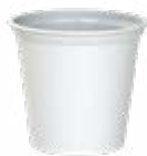
Mod.: 22223 6 oz. - (220 ml) 3.12" (W) X 2.83" (H)