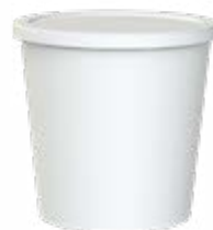
Mod.: 27526 24 oz. - (750 ml) 4.57" (W) X 4.43" (H)