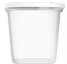
8 oz. - 250 ml 4,600" (D) X 1,743" (H)