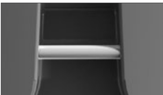
Rotating metal catch bar