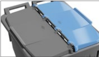
Lids attached in the center with a plastic rod