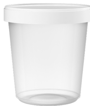
Mod.: 25042 16 oz. - (500 ml) 3.78" (W) X 4.06" (H)