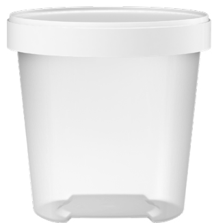
Mod.: 24442 14 oz. - (420 ml) 3.78" (W) X 3.70" (H)