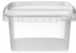
Mod.: 23595 12 oz. - (350 ml) 4.28" (W) X 2.39" (H)