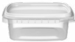
Mod.: 22595 8 oz. - (250 ml) 4.28" (W) X 1.63" (H)