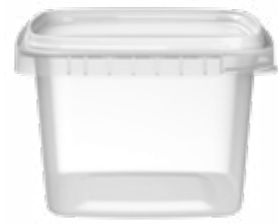
Mod.: 25095 16 oz. - (500 ml) 4.28" (W) X 3.00" (H)