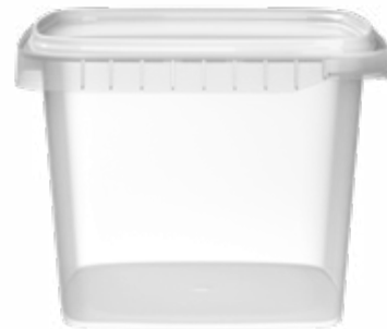
Mod.: 21545 48 oz. - (1.5 L) 5.84" (W) X 4.51" (H)