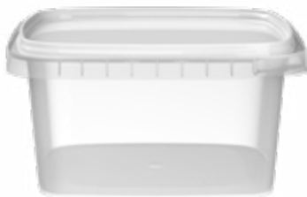
Mod.: 21145 32 oz. - (1 L) 5.84" (W) X 3.00" (H)