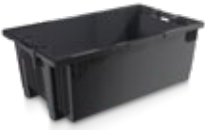
StakNest 70L 60258

The revamped structure of the StackNest with load capacity of 70 liters or 150 pounds, designed to withstand thumps and bumps. When empty, the StackNest can be nested with all other competitor's brands, simply by turning them 180°. The components of its plastic makes it the champion of temperature variations.