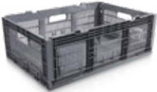
SmartCrate GP 6416 6416

The SmartCrate is ideal for harvesting and distribution of agricultural products. It offers superior stacking strength and durability which reduces the risk of damaged goods. This reusable plastic container is a collapsible, lightweight product with enhanced cooling capabilities to protect perishable merchandise.