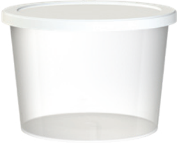
Mod.: 25521 18 oz. - (550 ml) 4.59" (W) X 3.14" (H)