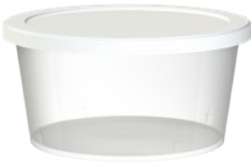
Mod.: 24021 12 oz. - (350 ml) 4.59" (W) X 2.23" (H)