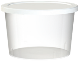
Mod.: 25021 16 oz. - (500 ml) 4.59" (W) X 2.90" (H)