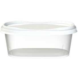
Mod.: 23128 10 oz. - (310 ml) 4.6 x 3.6" (W) X 1.84" (H)