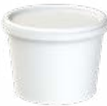
Mod.: 25023 18 oz. - (540 ml) 4.56" (W) X 3.23" (H)