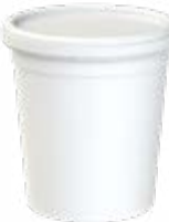
Mod.: 27423 27 oz. - (800 ml) 4.56" (W) X 4.82" (H)