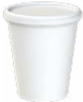
Mod.: 26523 26 oz. - (780 ml) 4.56" (W) X 5.05" (H)