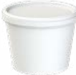
Mod.: 25123 18 oz. - (540 ml) 4.56" (W) X 3.36" (H)