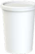
Mod.: 21123 34 oz. - (1 L) 4.56" (W) X 5.83" (H)