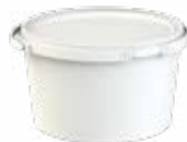
Mod.: 21560 48 oz. - (1.5 L) 6.78" (W) X 3.89" (H)