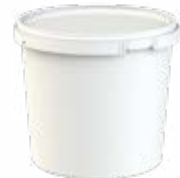
Mod.: 22570 84 oz. - (2.5 L) 6.83" (W) X 6.16" (H)